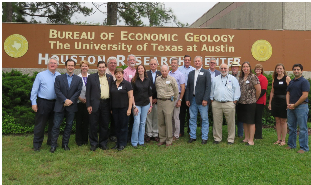
The GCAGS Leadership Team, April 10, 2015, Houston mid-year meeting

The GCAGS held the section’s 2015 Imperial Barrel Award competition on Friday, April 17 at the Schlumberger SIS facility in Houston. Eleven teams took part in the competition. The University of New Orleans placed first, University of Louisiana, Lafayette placed second, University of Texas at Austin and Stephen F. Austin State University tied for third. The GCAGS is extremely proud of the students