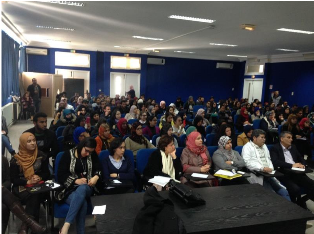
Cross Section of participants at the 2015/2016 DL Tour for Africa Region – Tunis El Manah, Tunisia.