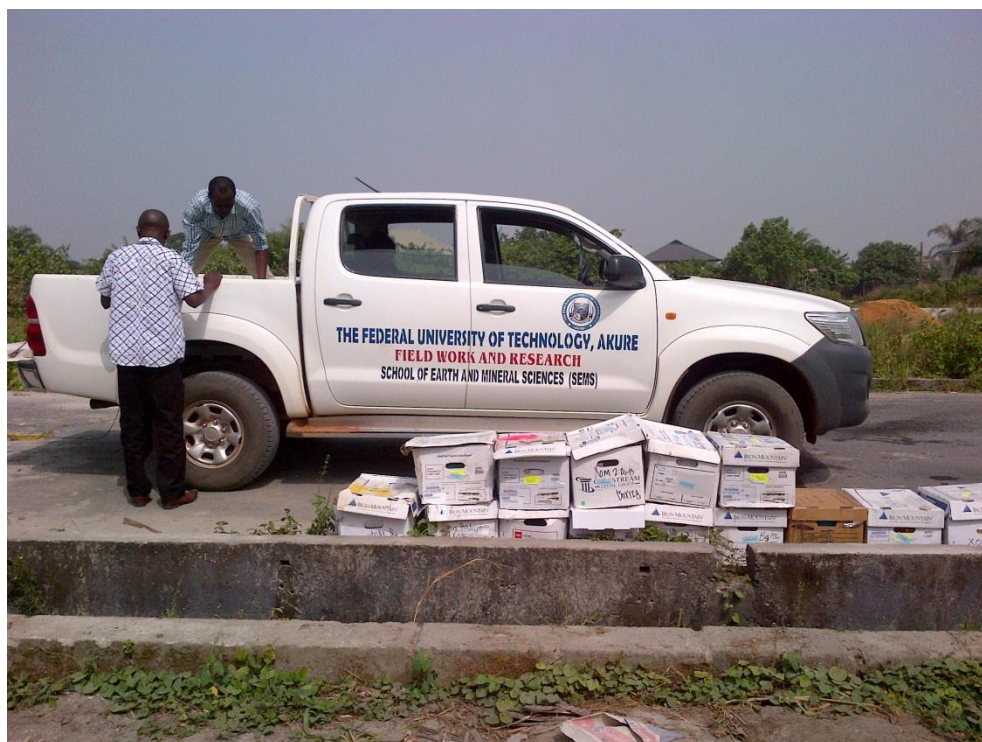
F. U. T. Akure collecting book shipment at storage facility in Lagos