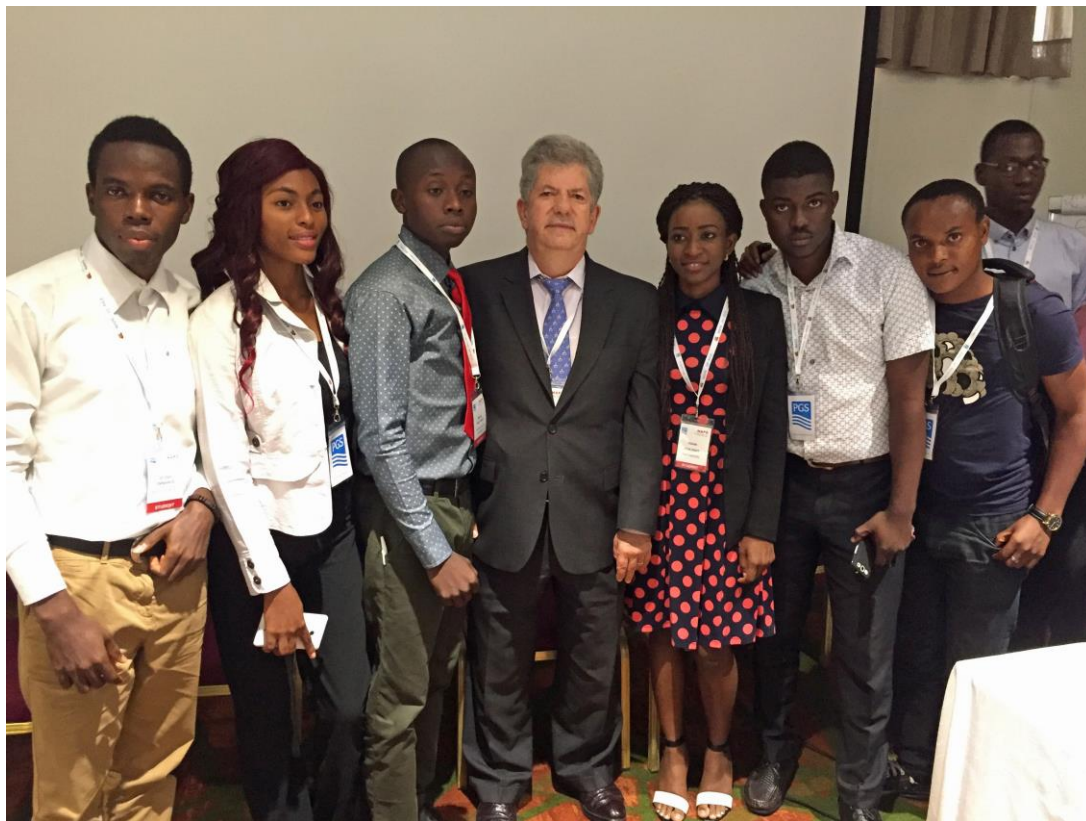
Student invitees at the AAPG/NAPE L-SCLS meeting in Lagos. November 2015