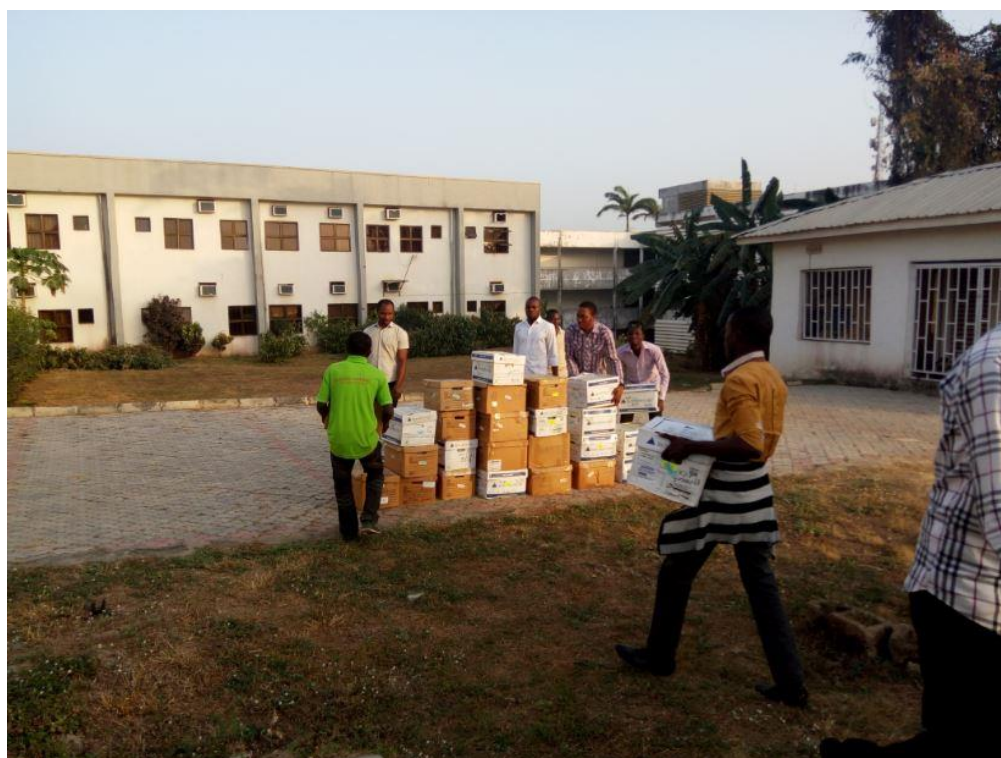
Publications pipeline book shipment arriving at Obafemi Awolowo University, Ife.