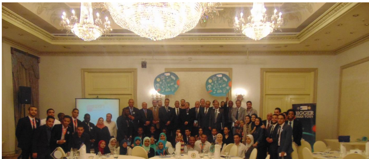
2016 YP networking reception – Cairo, Egypt – Sponsored by Transglobe