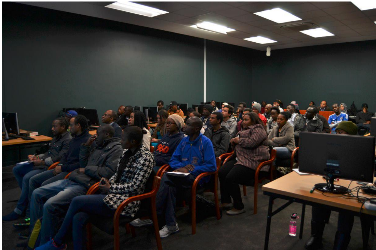
VGP Lecture – Ray Leonard at University of Western Cape, South Africa – August 2015.

A total of six VG lectures were delivered in the Region within the year.