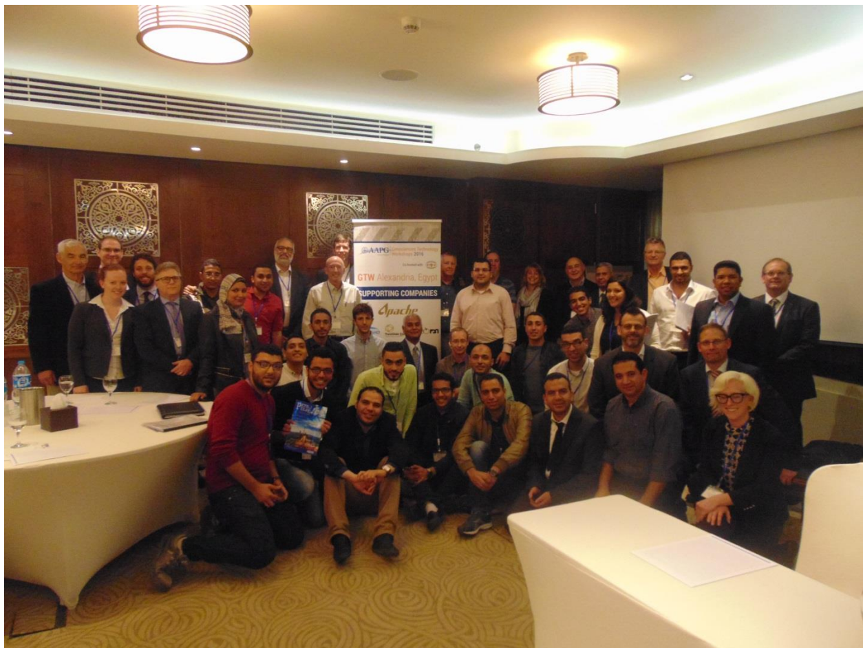
Group Photo: Attendees in group photo with organizing committee – GTW Alexandria, Egypt. March 2016.