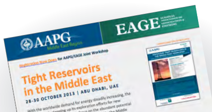
Co-sponsored events – Email blast