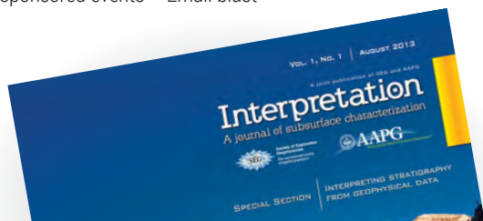
Joint venture – Magazine cover